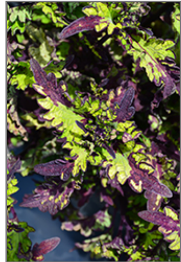
Rodeo Drive Coleus foliage

Rodeo Drive Coleus is recommended for the following landscape applications;