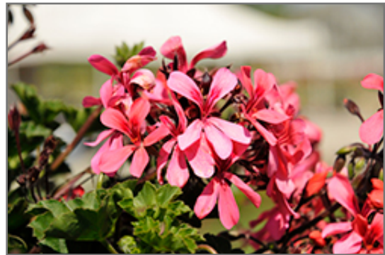
Caldera Salmon Geranium flowers

Caldera Salmon Geranium is recommended for the following landscape applications;