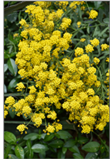
Golden Spring Alpine Alyssum flowers

This plant is not reliably hardy in our region, and certain restrictions may apply; contact the store for more information.