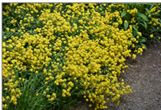
Golden Spring Alpine Alyssum in bloom