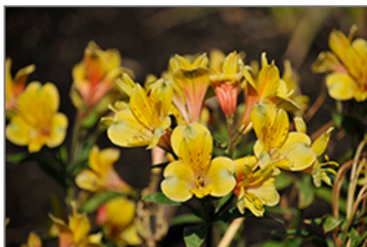
Golden Tiara Alstroemeria flowers