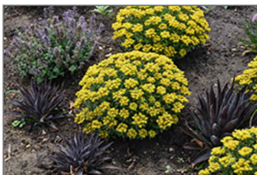
Rock 'N Round Bright Idea Stonecrop in bloom