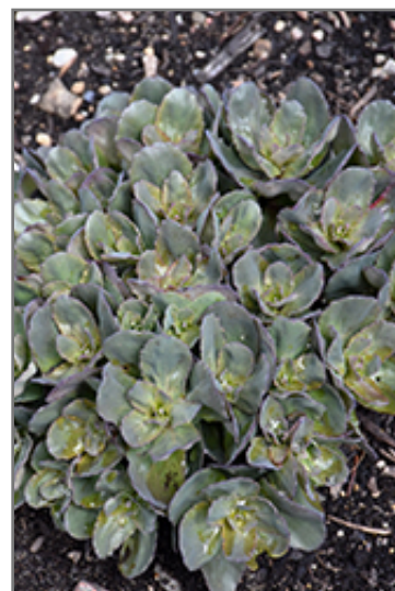
Rock 'N Grow Back in Black Stonecrop foliage