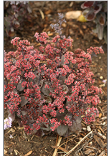
Rock 'N Grow Back in Black Stonecrop flowers

This plant is not reliably hardy in our region, and certain restrictions may apply; contact the store for more information.