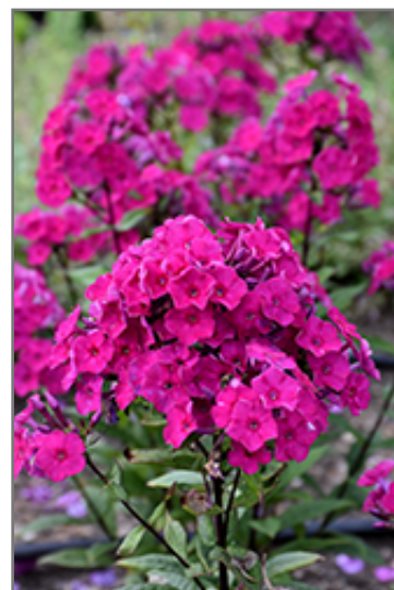
Super Ka-Pow Fuchsia Garden Phlox flowers