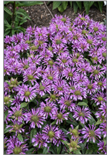
Leading Lady Amethyst Beebalm flowers

This plant is not reliably hardy in our region, and certain restrictions may apply; contact the store for more information.