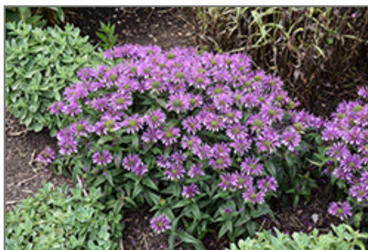
Leading Lady Amethyst Beebalm in bloom