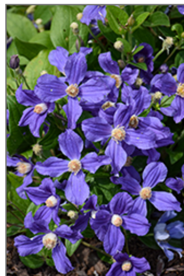
Rain Dance Clematis flowers