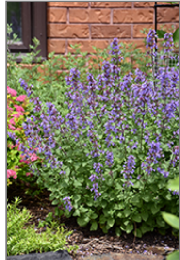
Picture Purrfect Catmint flowers