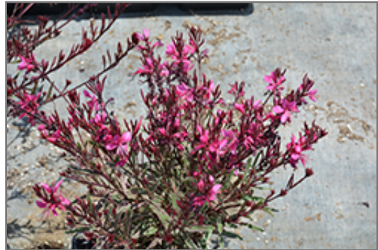
Gambit Variegata Rose Gaura in bloom