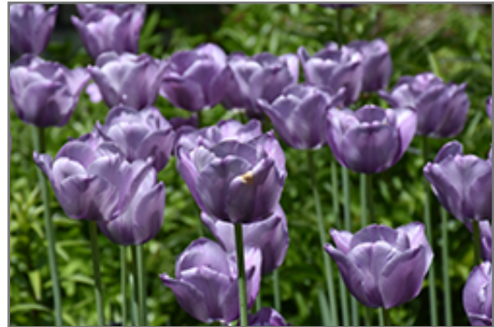
Bleu Aimable Tulip flowers