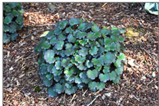
Pink Elf Saxifrage