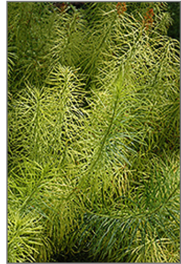
Narrow-Leaf Blue Star foliage

This plant is not reliably hardy in our region, and certain restrictions may apply; contact the store for more information.