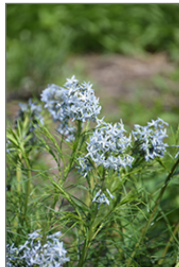
Narrow-Leaf Blue Star flowers