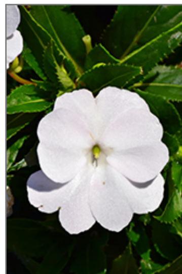
SunStanding Apollo White Cloud Impatiens flowers

SunStanding Apollo White Cloud Impatiens is recommended for the following landscape applications;