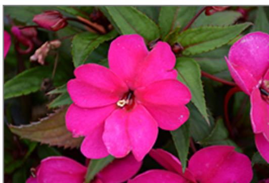
SunStanding Apollo Purple Impatiens flowers