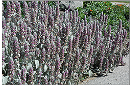
Lamb's Ears in bloom

Lamb's Ears will grow to be about 12 inches tall at maturity extending to 24 inches tall with the flowers, with a spread of 18 inches. When grown in masses or used as a bedding plant, individual plants should be spaced approximately 15 inches apart. Its foliage tends to remain dense right to the ground, not requiring facer plants in front. It grows at a fast rate, and under ideal conditions can be expected to live for approximately 10 years. As an herbaceous perennial, this plant will usually die back to the crown each winter, and will regrow from the base each spring. Be careful not to disturb the crown in late winter when it may not be readily seen!