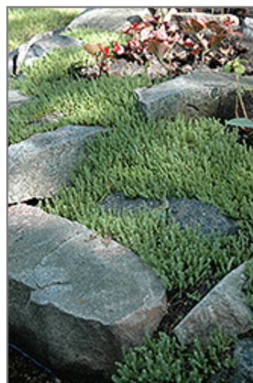
Six Row Stonecrop