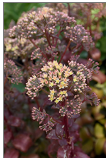
Peach Pearls Stonecrop flowers

Peach Pearls Stonecrop is recommended for the following landscape applications;