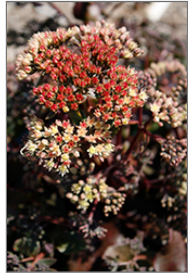
Peach Pearls Stonecrop flowers

This plant is not reliably hardy in our region, and certain restrictions may apply; contact the store for more information.