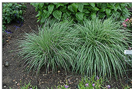
Blue Heaven Bluestem