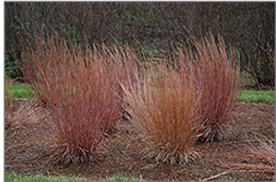
Blue Heaven Bluestem in fall

This plant should only be grown in full sunlight. It is very adaptable to both dry and moist locations, and should do just fine under typical garden conditions. It is considered to be drought-tolerant, and thus makes an ideal choice for a low-water garden or xeriscape application. It is not particular as to soil type or pH. It is somewhat tolerant of urban pollution. This is a selection of a native North American species. It can be propagated by division; however, as a cultivated variety, be aware that it may be subject to certain restrictions or prohibitions on propagation.