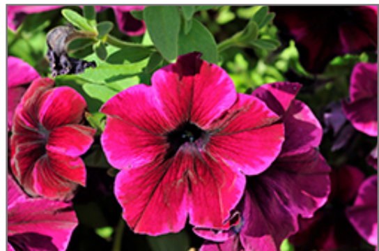
Crazytunia Cosmic Purple Petunia flowers