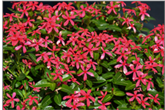
Soiree Kawaii Red Shades Vinca flowers

This plant will require occasional maintenance and upkeep, and should not require much pruning, except when necessary, such as to remove dieback. It is a good choice for attracting butterflies to your yard, but is not particularly attractive to deer who tend to leave it alone in favor of tastier treats. It has no significant negative characteristics.