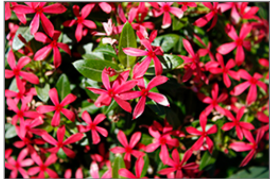
Soiree Kawaii Red Shades Vinca flowers

Soiree Kawaii Red Shades Vinca is a fine choice for the garden, but it is also a good selection for planting in outdoor containers and hanging baskets. Because of its trailing habit of growth, it is ideally suited for use as a 'spiller' in the 'spiller-thriller-filler' container combination; plant it near the edges where it can spill gracefully over the pot. Note that when growing plants in outdoor containers and baskets, they may require more frequent waterings than they would in the yard or garden.