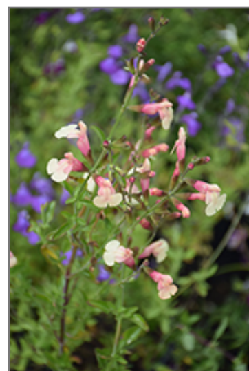
Sierra de San Antonio Sage flowers