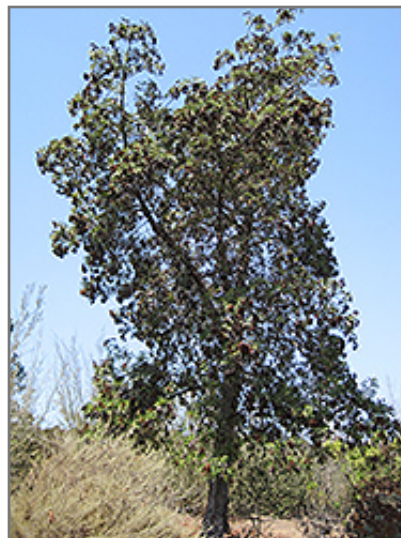
Santa Cruz Island Ironwood