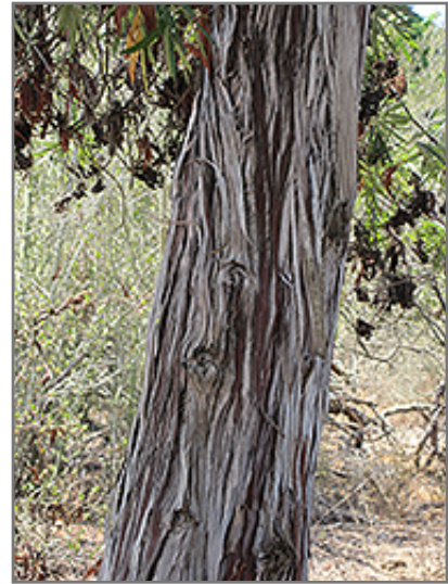
Santa Cruz Island Ironwood bark

This plant is not reliably hardy in our region, and certain restrictions may apply; contact the store for more information.