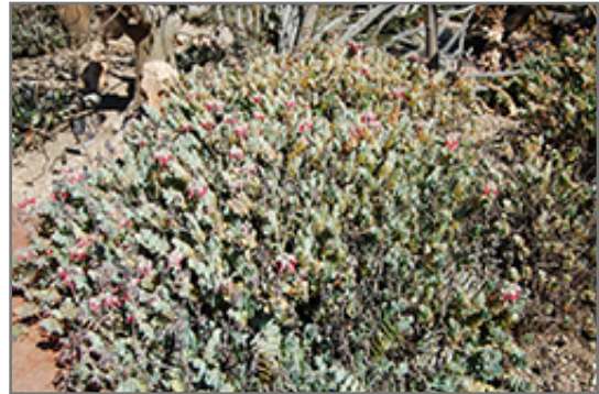
Marnier's Kalanchoe

Marnier's Kalanchoe will grow to be about 20 inches tall at maturity, with a spread of 3 feet. When grown in masses or used as a bedding plant, individual plants should be spaced approximately 30 inches apart. Its foliage tends to remain dense right to the ground, not requiring facer plants in front. It grows at a slow rate, and under ideal conditions can be expected to live for approximately 10 years. As an evergreen perennial, this plant will typically keep its form and foliage year-round.