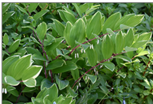
Variegated Solomon's Seal flowers