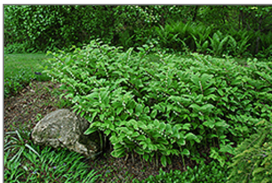
Variegated Solomon's Seal in bloom