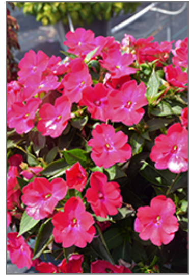
SunPatiens Compact Rose Glow New Guinea Impatiens flowers

SunPatiens Compact Rose Glow New Guinea Impatiens is a fine choice for the garden, but it is also a good selection for planting in outdoor containers and hanging baskets. It can be used either as 'filler' or as a 'thriller' in the 'spiller-thriller-filler' container combination, depending on the height and form of the other plants used in the container planting. It is even sizeable enough that it can be grown alone in a suitable container. Note that when growing plants in outdoor containers and baskets, they may require more frequent waterings than they would in the yard or garden.