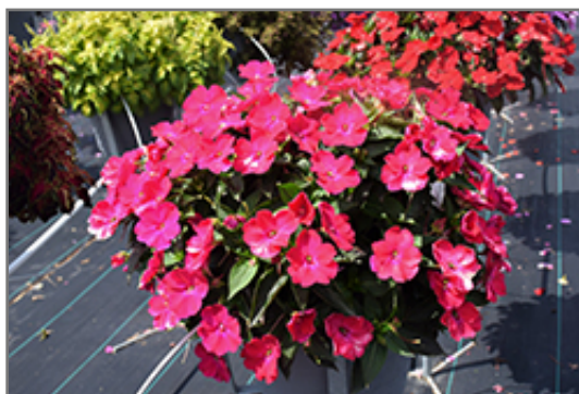
SunPatiens Compact Rose Glow New Guinea Impatiens in bloom