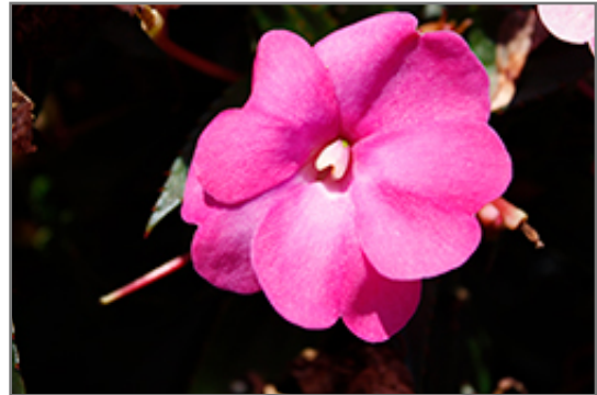
SunPatiens Compact Hot Pink New Guinea Impatiens flowers

SunPatiens Compact Hot Pink New Guinea Impatiens is recommended for the following landscape applications;