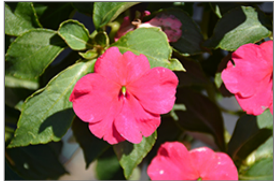
Beacon Rose Impatiens flowers

Beacon Rose Impatiens will grow to be about 15 inches tall at maturity, with a spread of 12 inches. When grown in masses or used as a bedding plant, individual plants should be spaced approximately 8 inches apart. Its foliage tends to remain dense right to the ground, not requiring facer plants in front. This fast-growing annual will normally live for one full growing season, needing replacement the following year.