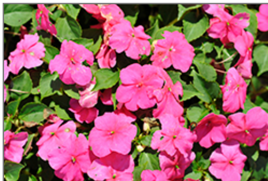
Beacon Rose Impatiens flowers

Beacon Rose Impatiens is recommended for the following landscape applications;