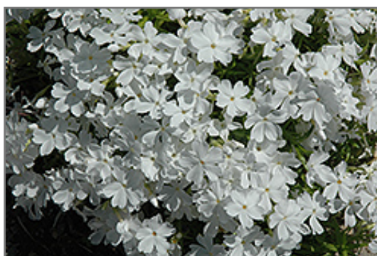
White Delight Moss Phlox flowers