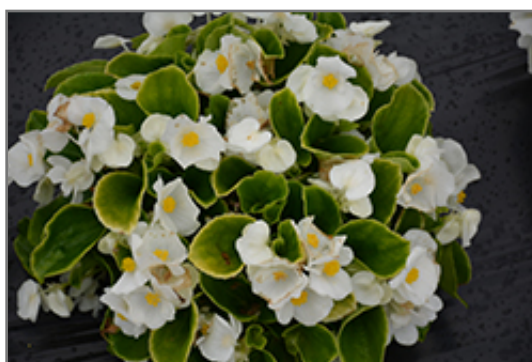
Sprint Plus White Begonia in bloom