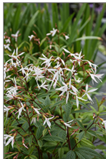
Bowman's Root flowers

Bowman's Root is recommended for the following landscape applications;