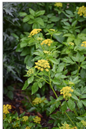
Golden Alexander flowers

Golden Alexander is recommended for the following landscape applications;