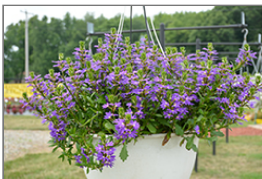
Purple Haze Fan Flower in bloom