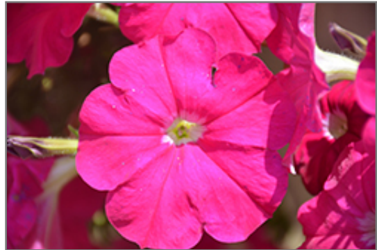
Sanguna Hot Rose Petunia flowers

Sanguna Hot Rose Petunia is recommended for the following landscape applications;