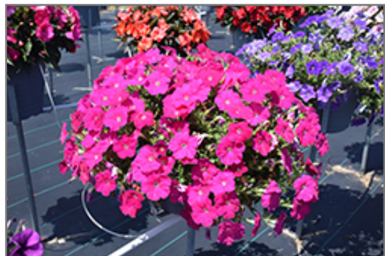
Sanguna Hot Rose Petunia in bloom