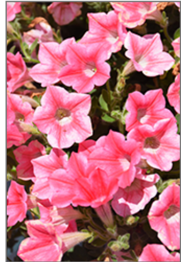
Dekko Star Coral Petunia flowers

Dekko Star Coral Petunia is a fine choice for the garden, but it is also a good selection for planting in outdoor containers and hanging baskets. Because of its spreading habit of growth, it is ideally suited for use as a 'spiller' in the 'spiller-thriller-filler' container combination; plant it near the edges where it can spill gracefully over the pot. Note that when growing plants in outdoor containers and baskets, they may require more frequent waterings than they would in the yard or garden.