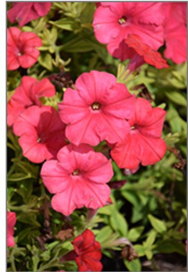
ColorRush Watermelon Red Petunia flowers

ColorRush Watermelon Red Petunia is a fine choice for the garden, but it is also a good selection for planting in outdoor containers and hanging baskets. It is often used as a 'filler' in the 'spiller-thriller-filler' container combination, providing a mass of flowers against which the thriller plants stand out. Note that when growing plants in outdoor containers and baskets, they may require more frequent waterings than they would in the yard or garden.