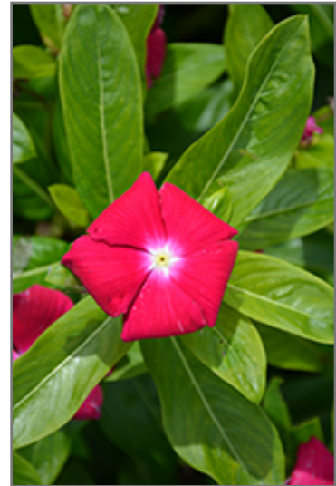
Cora XDR Cranberry flowers

Cora XDR Cranberry is a fine choice for the garden, but it is also a good selection for planting in outdoor containers and hanging baskets. It is often used as a 'filler' in the 'spiller-thriller-filler' container combination, providing a mass of flowers against which the thriller plants stand out. Note that when growing plants in outdoor containers and baskets, they may require more frequent waterings than they would in the yard or garden.