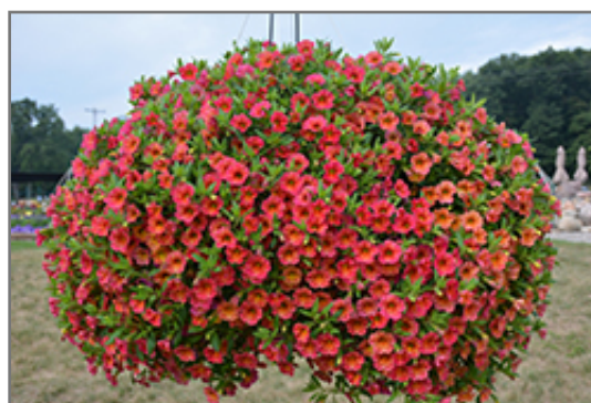
Chameleon Atomic Orange Calibrachoa in bloom