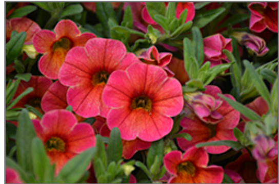
Chameleon Atomic Orange Calibrachoa flowers