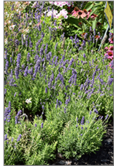
Blue Spear Lavender in bloom

Blue Spear Lavender is a fine choice for the garden, but it is also a good selection for planting in outdoor pots and containers. It is often used as a 'filler' in the 'spiller-thriller-filler' container combination, providing a mass of flowers and foliage against which the thriller plants stand out. Note that when growing plants in outdoor containers and baskets, they may require more frequent waterings than they would in the yard or garden.