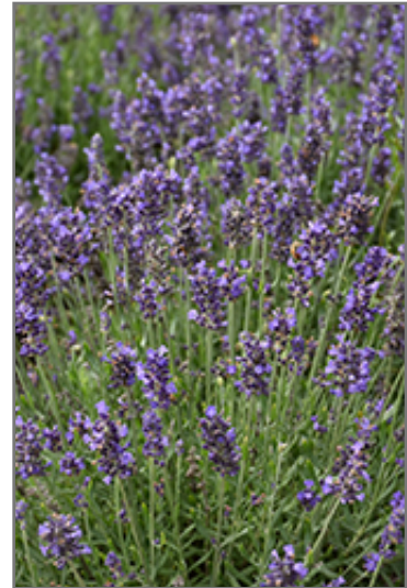
Blue Spear Lavender flowers