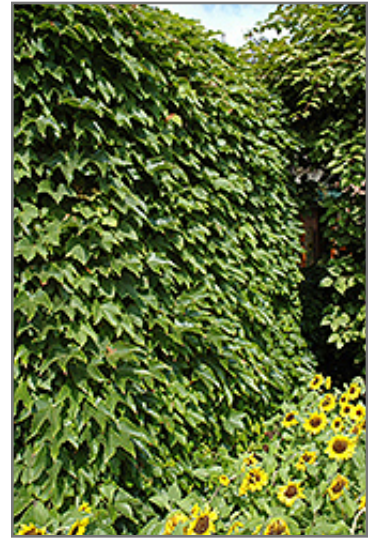
Boston Ivy

This plant is not reliably hardy in our region, and certain restrictions may apply; contact the store for more information.