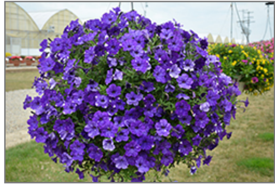
Headliner Night Sky Petunia in bloom

Headliner Night Sky Petunia will grow to be about 16 inches tall at maturity, with a spread of 30 inches. When grown in masses or used as a bedding plant, individual plants should be spaced approximately 24 inches apart. Its foliage tends to remain dense right to the ground, not requiring facer plants in front. This fast-growing annual will normally live for one full growing season, needing replacement the following year.