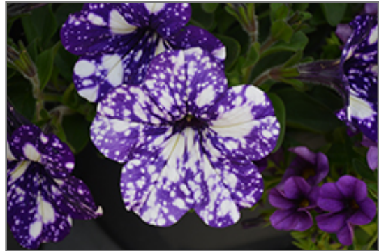
Headliner Night Sky Petunia flowers

Headliner Night Sky Petunia is recommended for the following landscape applications;