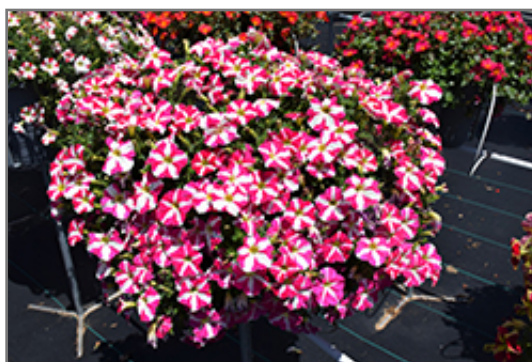
Amore Pink Heart Petunia in bloom