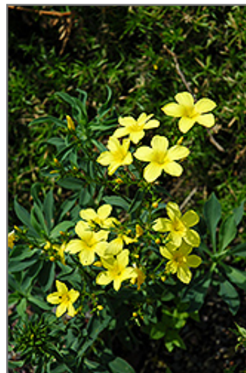
Dwarf Perennial Flax flowers