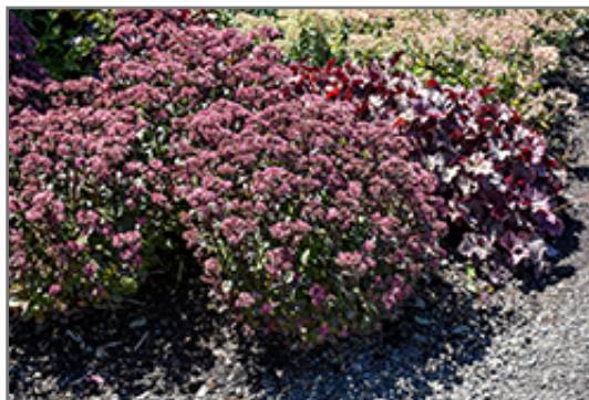
Double Martini Stonecrop in bloom

This plant is not reliably hardy in our region, and certain restrictions may apply; contact the store for more information.