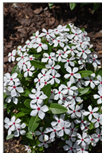
Soiree Kawaii White Peppermint Vinca flowers

Soiree Kawaii White Peppermint Vinca is recommended for the following landscape applications;