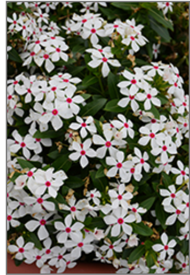
Soiree Kawaii White Peppermint Vinca flowers

Soiree Kawaii White Peppermint Vinca is a fine choice for the garden, but it is also a good selection for planting in outdoor containers and hanging baskets. Because of its trailing habit of growth, it is ideally suited for use as a 'spiller' in the 'spiller-thriller-filler' container combination; plant it near the edges where it can spill gracefully over the pot. Note that when growing plants in outdoor containers and baskets, they may require more frequent waterings than they would in the yard or garden.