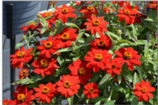
Profusion Red Zinnia in bloom

Profusion Red Zinnia is recommended for the following landscape applications;