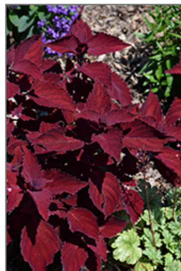
Beale Street Coleus foliage