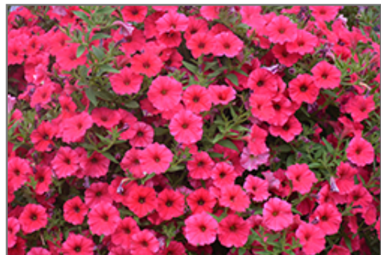
Supertunia Vista Paradise Petunia flowers