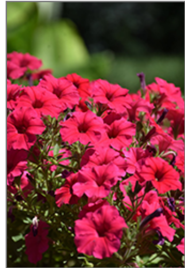
Supertunia Vista Paradise Petunia flowers

This plant will require occasional maintenance and upkeep. Trim off the flower heads after they fade and die to encourage more blooms late into the season. It is a good choice for attracting butterflies and hummingbirds to your yard, but is not particularly attractive to deer who tend to leave it alone in favor of tastier treats. It has no significant negative characteristics.