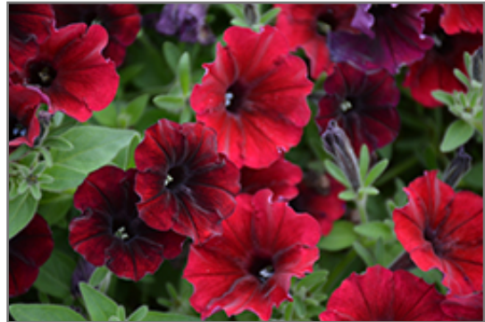
Supertunia Black Cherry Petunia flowers

Supertunia Black Cherry Petunia is a fine choice for the garden, but it is also a good selection for planting in outdoor containers and hanging baskets. Because of its trailing habit of growth, it is ideally suited for use as a 'spiller' in the 'spiller-thriller-filler' container combination; plant it near the edges where it can spill gracefully over the pot. Note that when growing plants in outdoor containers and baskets, they may require more frequent waterings than they would in the yard or garden.